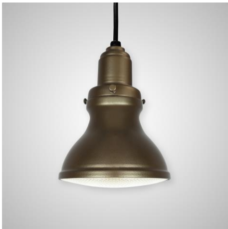
S238/19P/BLC/INC (SHOWN WITH PAR38 LAMP. NOT INCLUDED.)