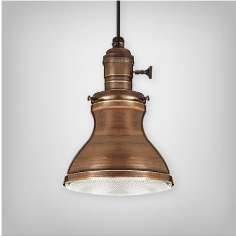
S2K38/19/BLC (SHOWN WITH PAR38 LAMP. NOT INCLUDED.)