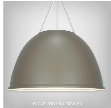
HLO22 . 89G.CBLC.60WLED